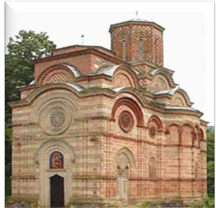
Morava School from 14 th until to 15 th century.