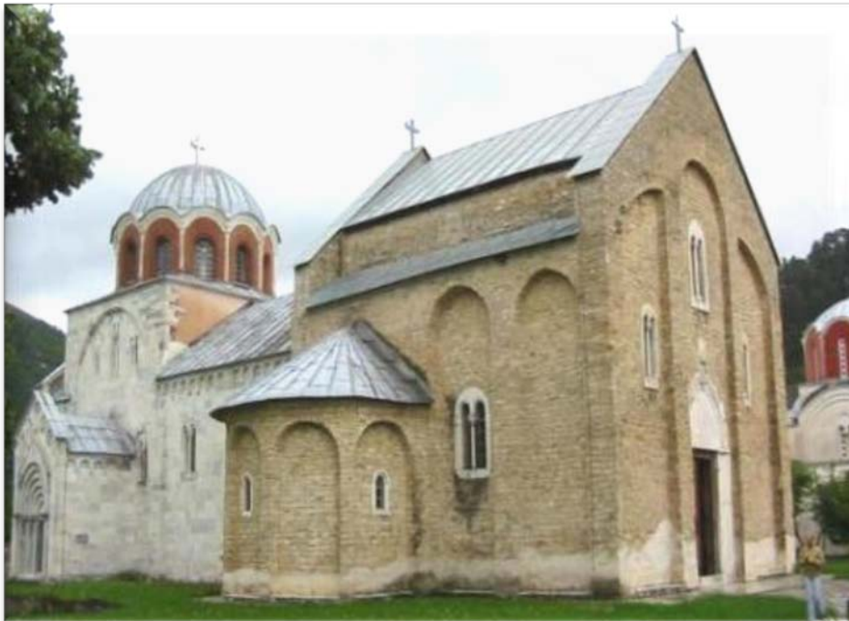
Raška School from 12 th and 14 th century (Romanesque influence).

The architecture style of mediaeval Serbian monasteries is particularly varied.