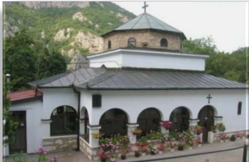
Monasteries on the Fruška Gora –northern part of Serbia. These monastic communities were historically recorded since the first decades of the 16 th century.