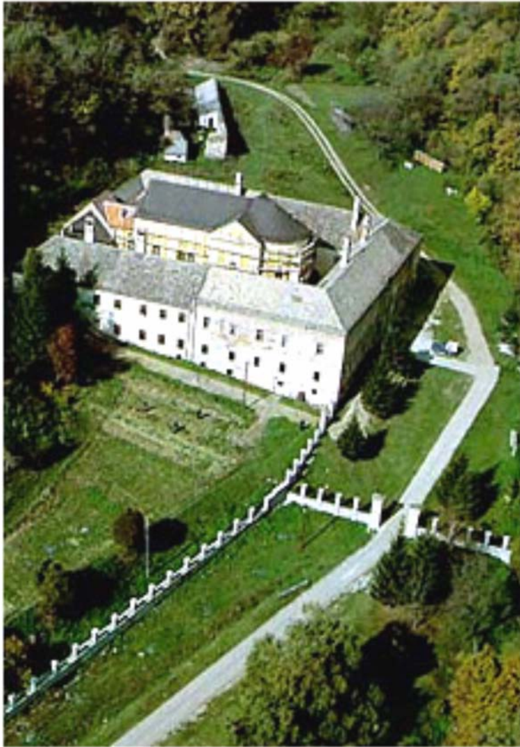
Ovčar -Kablar monasteries was named Serbian Holy Mountain. Most of these monasteries were built during the Ottoman occupation and they played very important cultural and artistic role in the history.